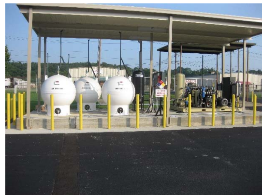
Alagasco WOC CNG- Bessemer, AL