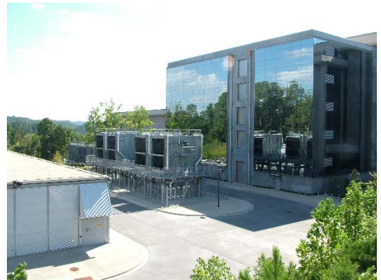
AT&T Regional Data Center