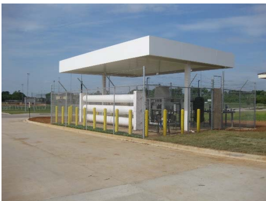
CNG Facility - Athens, AL 1

TS TECH CNG Boaz, Alabama Completed 2011