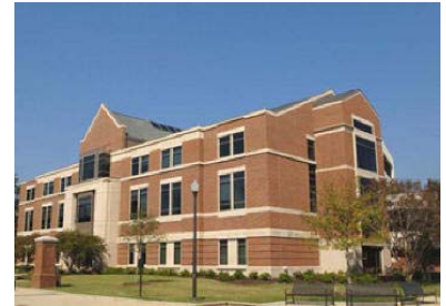
Harrison School of Pharmacy