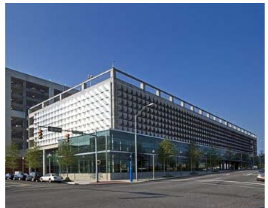
Children's Hospital Data Center